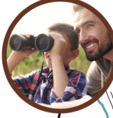
TREEHOUSE Get a great view of the reserve.