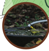
BIRD DRIP View birds as they stop for a quick drink.

Complete details on accessibility and other trail conditions can be found at www.aswp.org