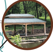
POND PAVILION Rest or have lunch beside the pond.