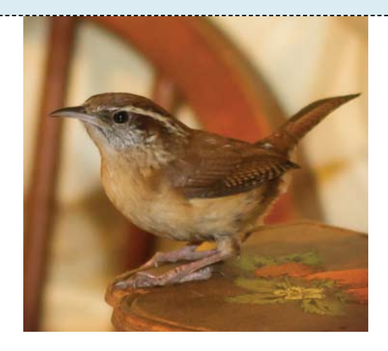
A Carolina Wren takes an indoor break.

This past January was another difficult month for the species; however some very clever survival tactics were noted in western Pennsylvania. A store owner in New Kensington reported that a Carolina Wren entered her store through sliding entrance doors on occasion. A local birdwatcher reported that a Carolina Wren was using his garage as safe (warm) haven the bird made its way into his dining room one day, and even spent some time perched near his dining table.