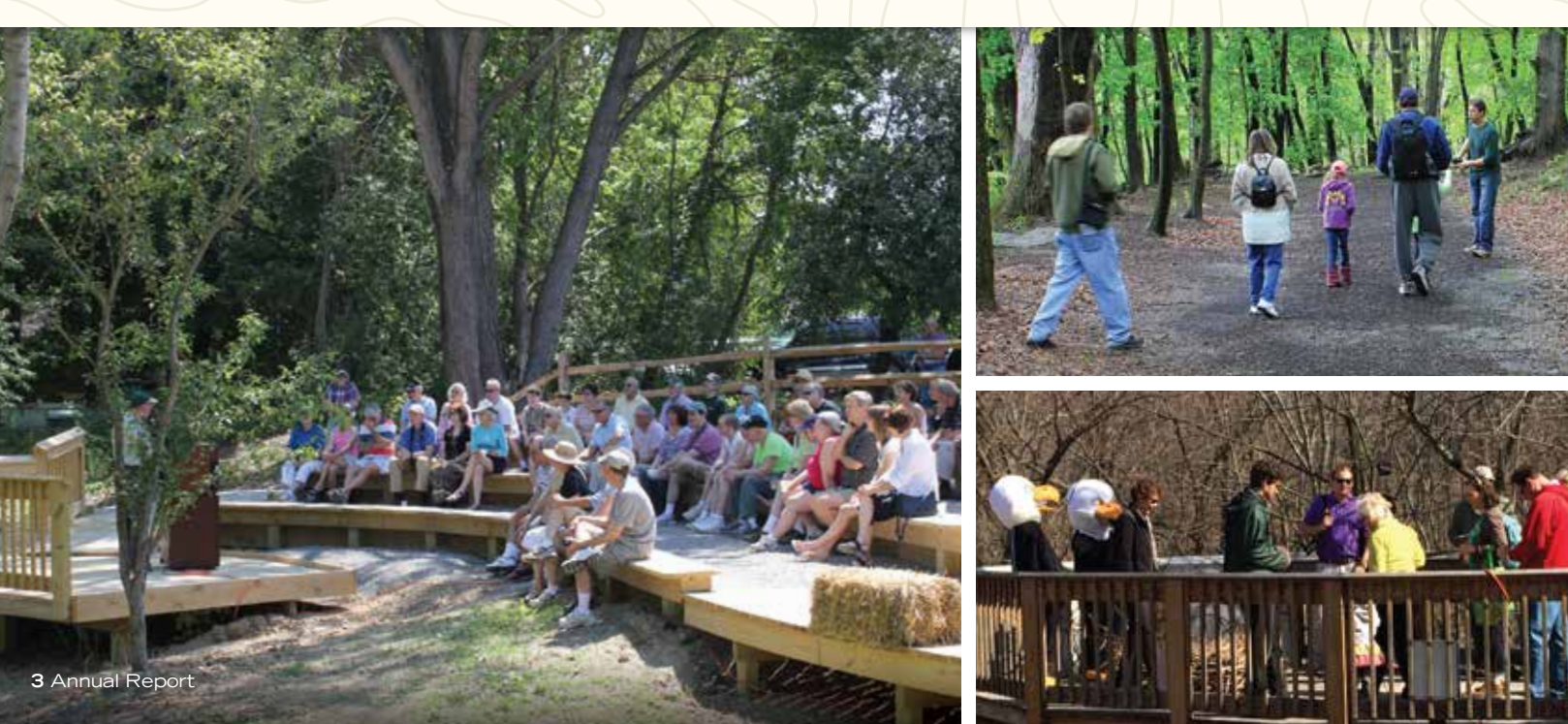
100 Citizen Science Programs